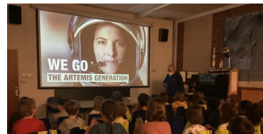
Year 5 visited the Planetarium in Chichester to be hooked into learning as part of their study of Space in science.