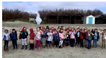
Year 2 enjoying a day at the beach with Chichester Harbour Conservancy Trust as a hook into their geographical Coast Learning Experience.