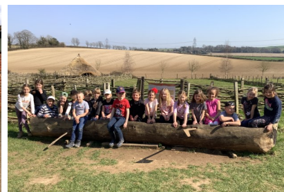
Y3 visited Butser Hill as part of their learning experience about The Stone Age on a lovely, sunny day!

We know how important these opportunities are for our little fish and are very grateful that you also recognise this importance and support us financially and with your time to support us in keeping the children safe on these visits. A huge thank you to all those of you who have volunteered your time to be able to support us! Please do remember that we do request that all those attending school trips to support with groups have a DBS certificate.