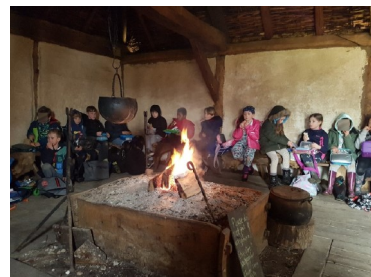
Year 4 being hooked into their learning while enjoying a day at Butser Ancient Farm.