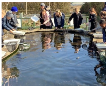
Year 5 were hooked into their learning at the Arundel Wetland Centre.

In our recent Parent Survey, many of you said how much your children had missed out on school trips and visitors over the last two academic years and we couldn't agree more! It has been just great to see that the children have been out and about enjoying lots of wonderful opportunities in our local area as well as being able to invite visitors back into school again.