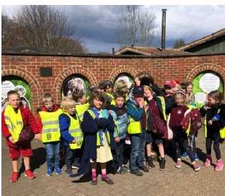
Y1 enjoyed their first school trip and visited Marwell as part of their learning experience.