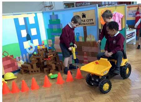
Our youngest children enjoyed a visit from Little City as part of their Hats Learning Experience!